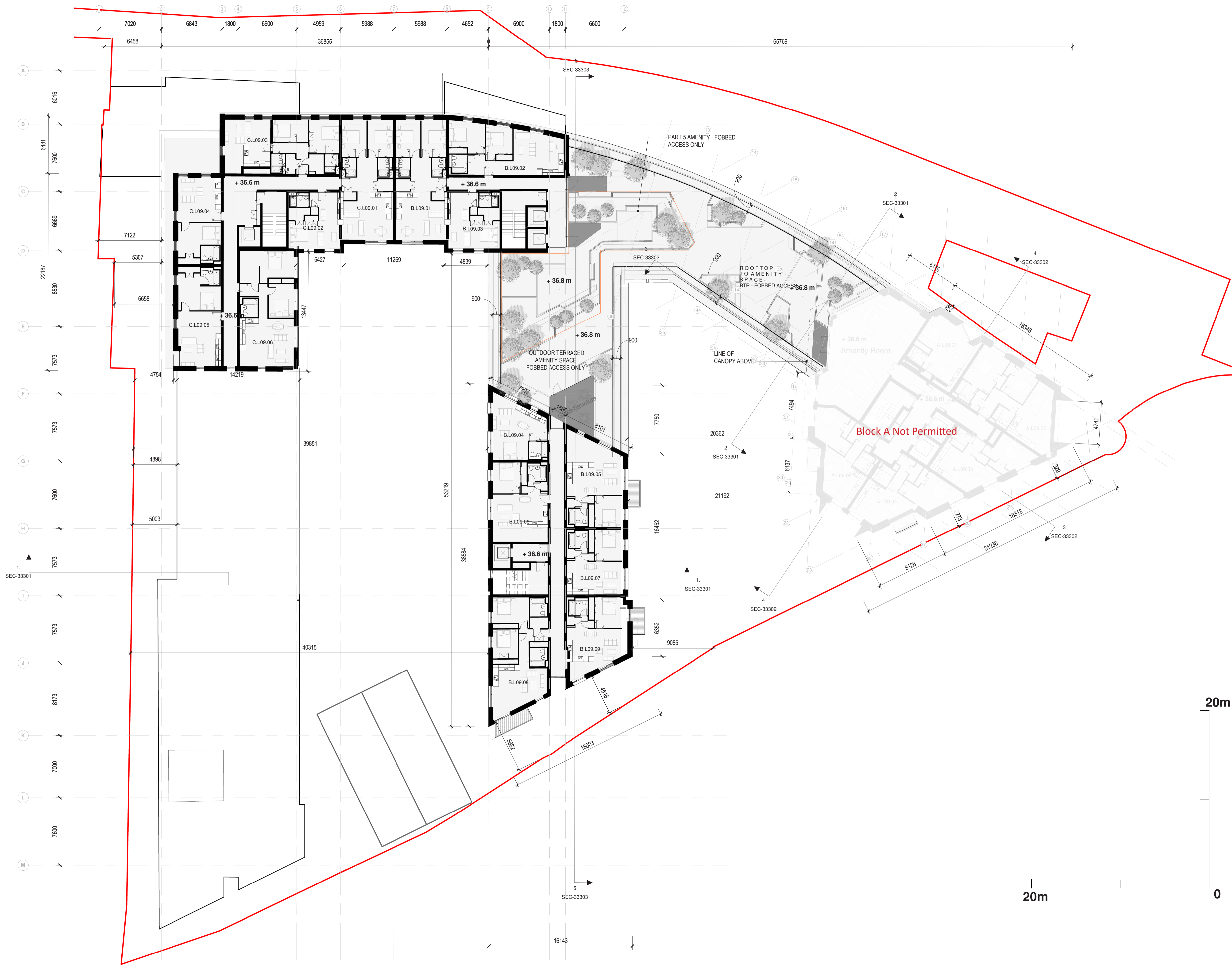
Proposed 9th Floor Plan 1 : 200

Notes: DO NOT SCALE FROM THIS DRAWING. USE FIGURED DIMENSIONS IN ALL CASES. VERIFY DIMENSIONS ON SITE AND REPORT ANY DISCREPANCIES TO THE ARCHITECTS IMMEDIATELY. THIS DRAWING TO BE READ IN CONJUNCTION WITH THE ARCHITECTS SPECIFICATION. © THIS DRAWING IS COPYRIGHT AND MAY ONLY BE REPRODUCED WITH THE ARCHITECTS PERMISSION. OSI License Number - AR 0052219 Projection / Spatial Reference: Projection: IRENET90_msh_Transverse_Mercator Centre Point Coordinates: X,Y = 713657.3699, 734403.2446 Reference Index: Map Series / Map Sheets 1:1,000 | 3263-02 1:1,000 | 3263-08 1:1,000 | 3263-07 1:1,000 | 3263-03 Vertical Datum: MALIN HEAD